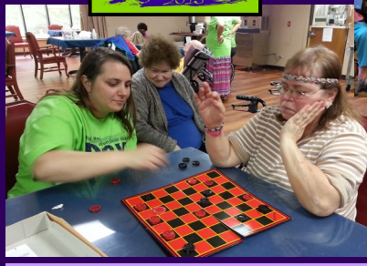
Board Games at Van Buren H&R