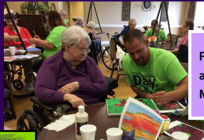
Paint with a Friend at Methodist

Day of Caring 2015 was a huge success! 90 volunteers gave over 270 hours visiting nursing home residents in our area. We appreciate local companies, partners, and individuals who participated in Day of Caring! Thanks to United Way of Fort Smith Area for coordinating this event. We can't wait until next year!