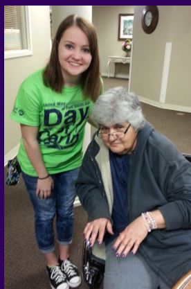
Visiting at Highlands