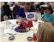
ABOVE: Van Buren Health & Rehab