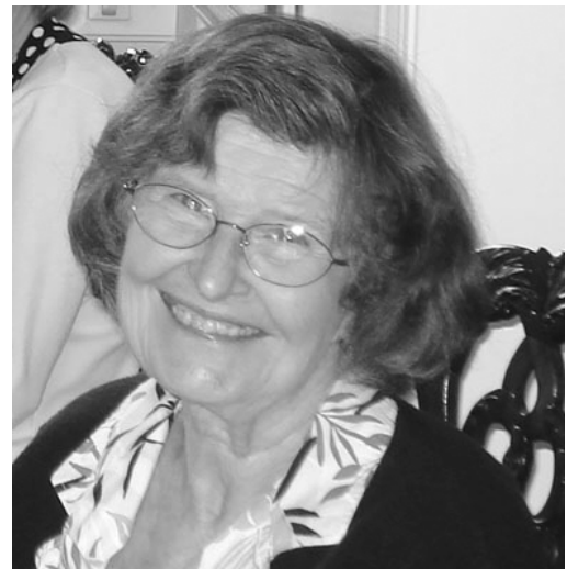
Sue Sherman Award