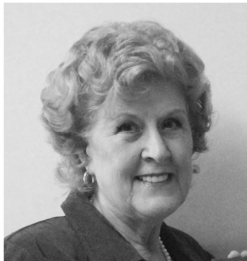
Gloria White Award